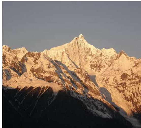
Spectacular Sunrise of Meili Snow Mountains from Feilaishi

Day 9 Zhongdian: We return to Zhongdian, stopping along the way to enjoy the spectacular views of the Meili & Baimang Snow Mountains, as well as the first bend in the Jinsha River, commonly known as the Omega Bend. In Zhongdian, we spend a second evening in the Old Town, and catch the