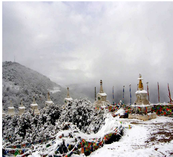
Snowing on the way to Zhongdian

Note on the TLG Trek - We leave our main luggage with the vehicles and carry only what is needed on the 3 days trek. The last group used the horses to carry the luggage at a cost of Rm30 per luggage for the duration of the trek, at member's own expense. This is recommended because it was much easier walking without the backpacks. We'll enjoy the scenery and photo-taking much better. Participants can also opt to ride all the way or