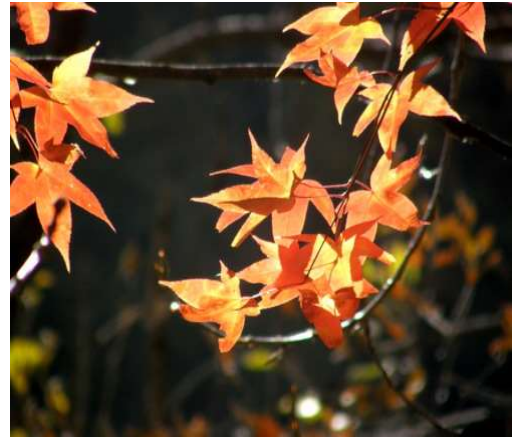
Spectacular Sunrise of Meili Snow Mountains & autumn colour from Felaishi

This is frontierland, China ! Yunnan is like the last bastion of Han China, before merging into Tibetan China on its west, and Indo-China on its south and east. The result is a land where myriad cultures thrive; from the UNESCO World Heritage Site Lijiang, to Tibetan Zhongdian and Deqin, the latter marking the route proper into Tibet . But culture aside, Yunnan also abounds in adventure, with the Mingyong Glaciers outside Deqin, horsing around in the pastures of Yak Meadow and surely the highlight, a 4 days trek onto the Tiger Leaping Gorge—a walk of wondrous sights, scents, and senses!