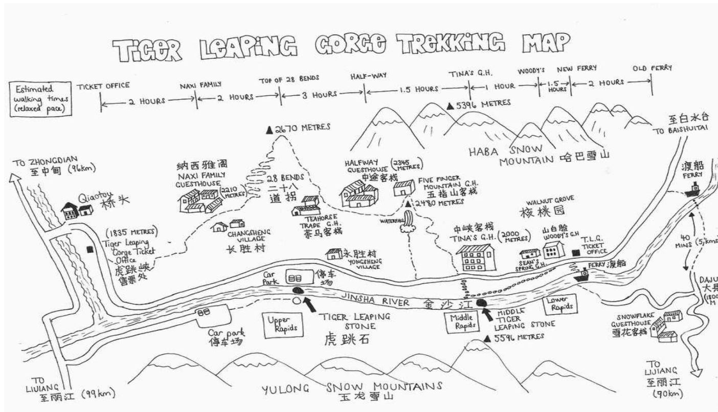
Map of Tiger Leaping Gorge

Day 12 TLG 3: Our last day on the trek will be take us about 4 hours, mostly downhill. There are some nice waterfalls on the way down to Tina's Guesthouse where we lunch. We will be back in Lijiang by late afternoon to enjoy the shopping, eating and drinking. ON Lijiang.