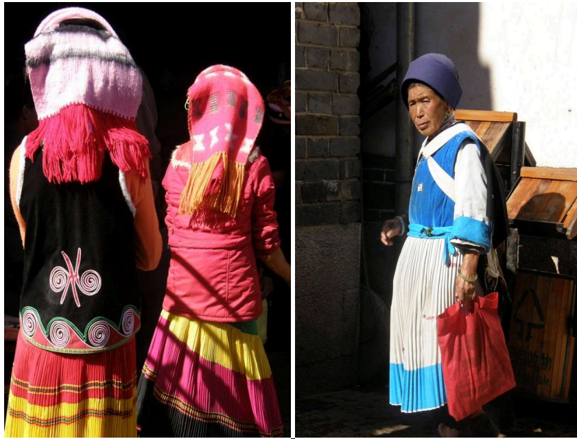
Minorities/UNESCO's Lijiang Old Town

Day 14 Lijiang-Airport: Take flight CZ6604 from Lijiang at 1100AM to Guangzhou, arriving 1320PM. Then transit CZ365 at 1735PM, arriving KL 2150PM (19Nov2024).